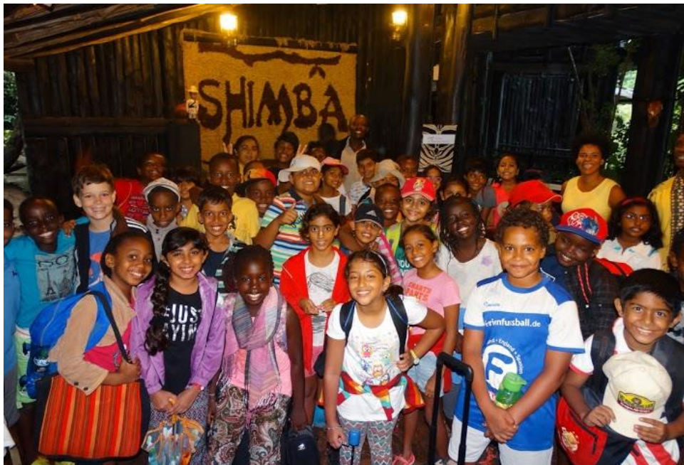
Year 4 Trip to Shimba Hills