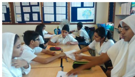
Year 5 with Year 7 students in big brother/sister roles