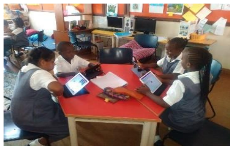
Year 1 Learning – Story time