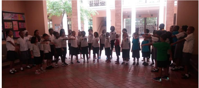
Music and Dance workshop