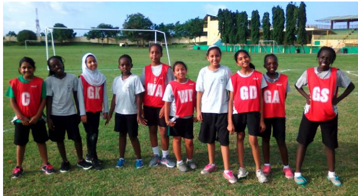
U11 Netball team