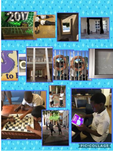
A collage from the photography workshop