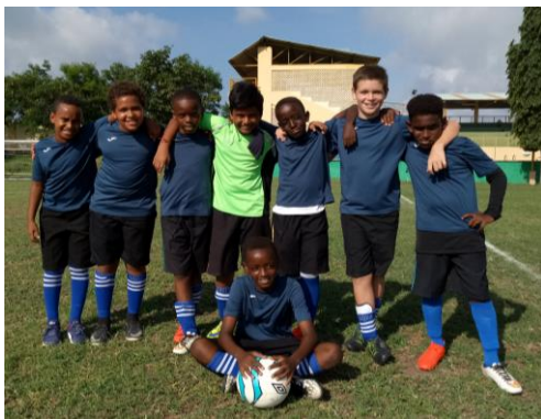
U11 Football team

On Tuesday 30 th May our junior teams for football and netball played Oshwal Academy for the league matches. The boys’ football team won 4 - 2 whilst the girls’ netball team girls lost their match 11- 1. The last round of matches for the season will be played on Tuesday 6th June with Braeburn Mombasa, here at the Academy.