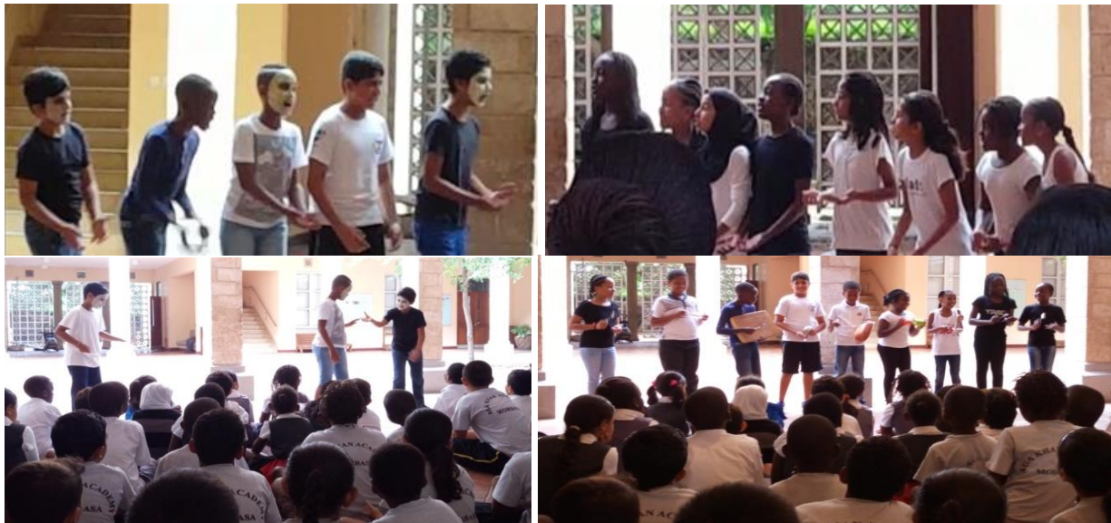
Year 4A Assembly

Students in Year 4 presented a three part performance for the assembly as provocations into their new unit on Drama. They expressed themselves through Luo tongue twisters, a mime Marikiti scene and a musical performance using kitchen tools. The students enjoyed brainstorming and collaborating with each other to bring an entertaining performance to the Junior School.