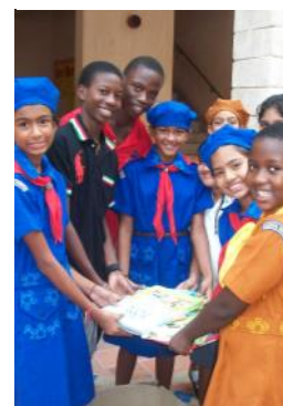
Gifts for distribution

Thinking Day—the Girl Guide fraternity celebrates Founder’s Day on 22 February. It is marked by Guides ‘thinking’ about the less fortunate in society by doing a service or donating towards their upkeep. Our Junior School Brownies and Guides in Years 1-5 collected soft toys, stationery, books and clothes that were then distributed in May to children from House of Hope, Orphans of Jomvu and Kaa Chonjo.