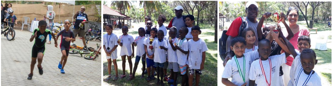
Triathlon and Aquathlon