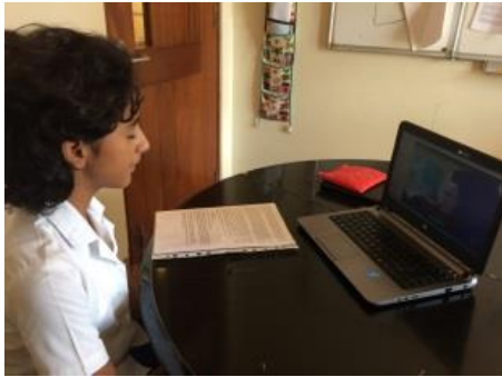
Exhibition presentation on skype