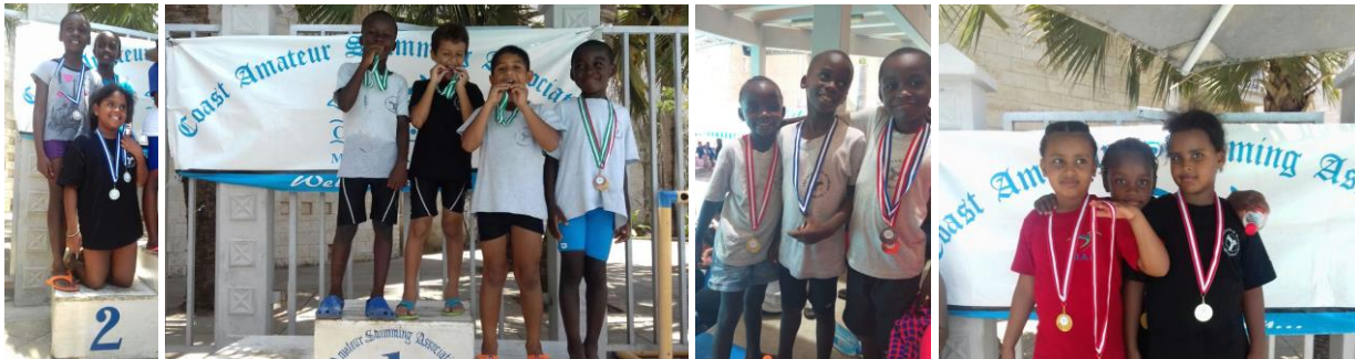
CASA 9 years and under gala

In the CASA U9 Sprints and Relays Swimming Gala held on 11 th and 12 th March, the AKA Mombasa team was represented by 35 swimmers who excelled and scooped a total of 43 medals; 11 gold, 22 silver and 10 bronze! All the participants improved tremendously in their seed time. Besides this, the swimmers had fun and enjoyed the competition. The AKA Mombasa girls' team took 2 nd place whilst the boys team took 4 th place, with an overall 3 rd position with both teams combined out of 12 schools and clubs. Congratulations and well done to this young, upcoming team!