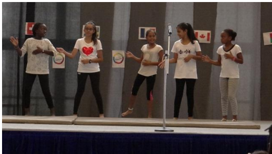
SRC - Opening dance act

We have truly talented students in our Junior School! This morning the students participated in a special assembly; the SRC Talent Show. Over the past two weeks, more than 80 students auditioned for this occasion. Following the auditions, a selection of finalists took part in today’s event which had members of the SRC as masters of ceremony, as well as presenting the opening act. Please see some photos from this animated gathering.