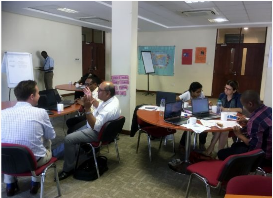
The core group in Mombasa working hard!