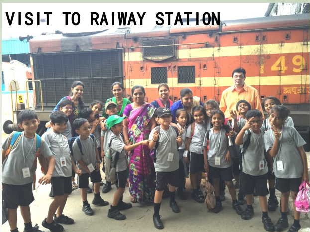
VISIT TO RAIWAY STATION

Grade 2 students went on an exhilarating and fun-filled trip during their unit on transport. The students were taken to the ‘Hyderabad Railway station’ to go for a train ride from Nampally to Falaknuma. The students explored the different places at the station, such as the ticket counter, ticket vending machine and the railway tracks and platforms of different trains arriving. On the way, they also observed the names of the stations from where passengers were boarding the train. We travelled in a first class compartment of a local-MMTS train where the students noticed a digital display of the station coming next along with the map of the train travelling to the various stations. It was fun to see them excited as many of them were travelling on a train for the first time.