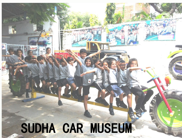
SUDHA CAR MUSEUM