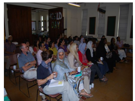
Parent information session on the Exhibition, May 3, 2012