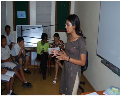
Talking through the process: The Ex' in a culminating experience for Year 6 students in the PYP. Year 6 teachers explain the process, requirements and the journey begins!