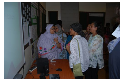
Parents as inquirers: Finding out what information is available in the Ex' journey display in the IWB Room