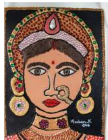
Muskan, Grade 10