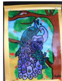
Leesha, Grade 10