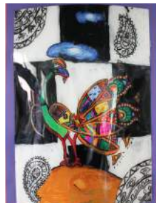
Ayaz, Grade 10