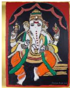
Shaivya, Grade 10